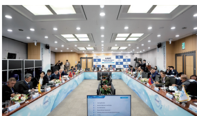
7 th AAWC Board Meeting