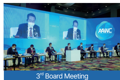
3 rd Board Meeting