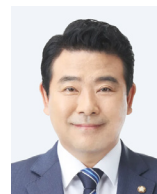
Jeung Park Member National Assembly of the Republic of Korea