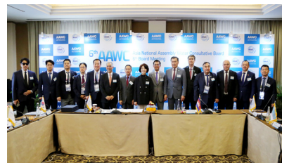
6 th Board Meeting