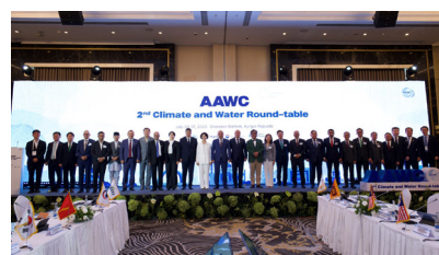
AAWC 2 nd Climate and Water Round-table