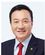
Tae-young Eom Member National Assembly of the Republic of Korea