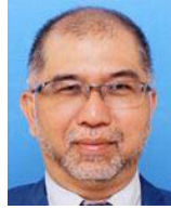
Muhammad Bakhtiar bin Wan Chik

Member House of Representatives of Malaysia