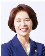
Jeoung-ae Han President National Assembly of the Republic of Korea