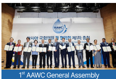
1 st AAWC General Assembly