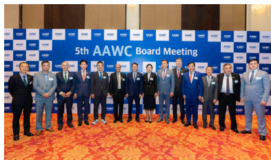
5 th Board Meeting