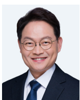
Young Huh Member National Assembly of the Republic of Korea