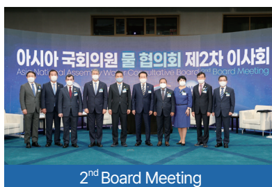
2 nd Board Meeting