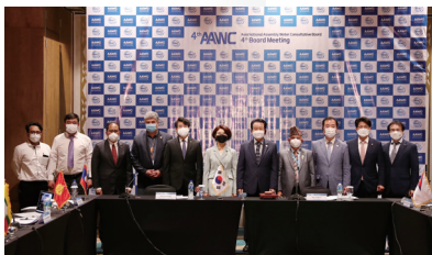
4 th Board Meeting