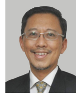
Zahir Bin Hassan

Member House of Representatives of Malaysia