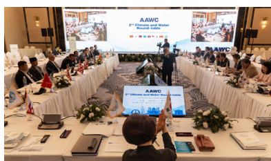
8 th AAWC Board Meeting