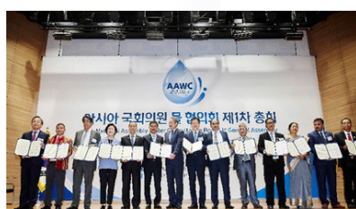
1 st AAWC General Assembly