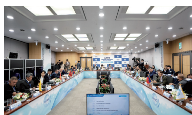
7 th AAWC Board Meeting