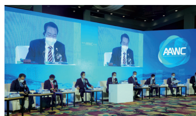
3 rd Board Meeting