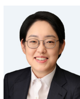
Ji-yeon Cho Member National Assembly of the Republic of Korea