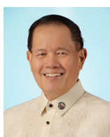
Romeo S. Momo

Member House of Representatives of the Philippines