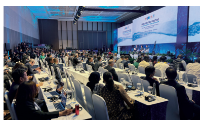
Parliamentary Meeting, 10 th WWF