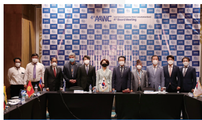
4 th Board Meeting