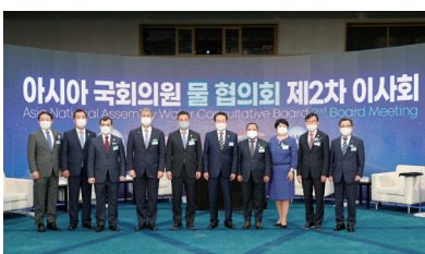
2 nd Board Meeting