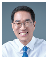
Ju-young Kim Treasurer National Assembly of the Republic of Korea