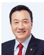
Tae-young Eom Member National Assembly of the Republic of Korea