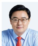
Sung-won Kim Member National Assembly of the Republic of Korea