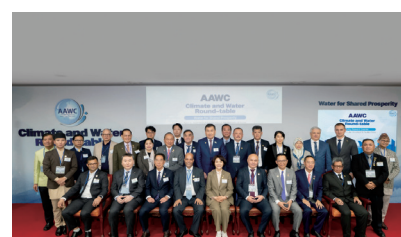
AAWC Climate and Water Round-table