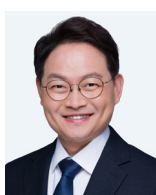
Young Huh Member National Assembly of the Republic of Korea