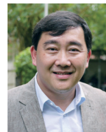
Suos Yara Vice President National Assembly of Cambodia