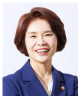
Jeoung-ae Han President National Assembly of the Republic of Korea