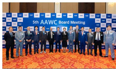
5 th Board Meeting