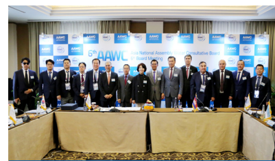
6 th Board Meeting