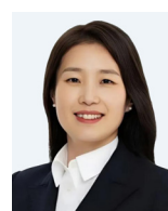
So-hee Kim Member National Assembly of the Republic of Korea